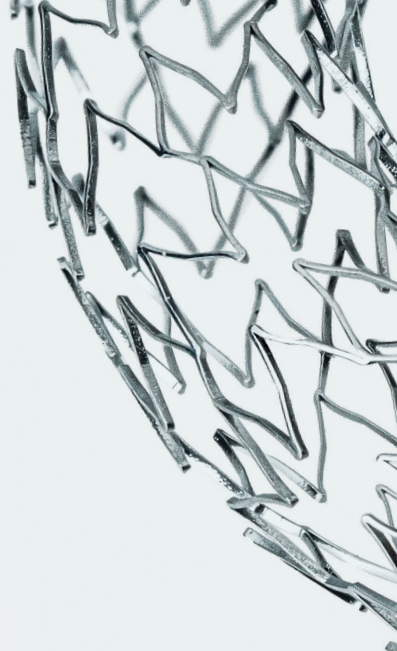
TENTOS 4F Application device

The new outer catheter material has significantly higher tensile strength and stability than previously used catheter materials for controlled and easy handling.